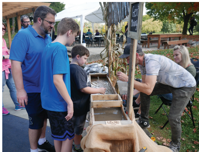
Mining for Treasure