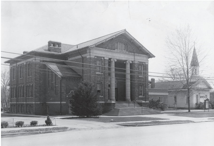
FIRST CHRISTIAN CHURCH AND CHILDREN'S CHAPEL