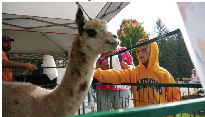
Alpaca and Friend

Thanks again to the vendors, artisans, and, especially, the many volunteers, who worked so hard to provide another successful Harvest Festival! ♦