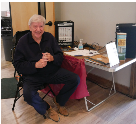
The Voice of Stow

Vintage cars clubs displayed their favorite vehicles, ranging from early 1900s Ford Model Ts to 1960s-era Chevrolet Corvairs.