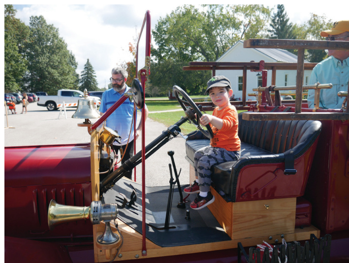
Tomorrow's Driver, Yesterday's Car

Thanks again to the vendors, artisans, and, especially, the many volunteers, who worked so hard to provide another successful Harvest Festival! ♦