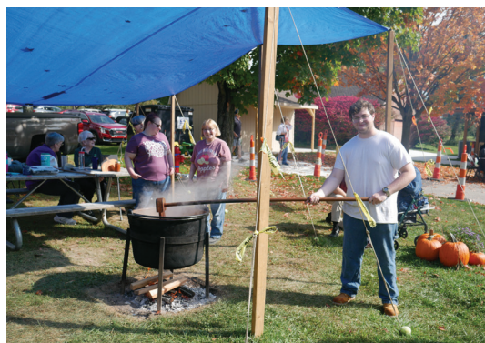
Apple Butter Boiler

The 45 th annual Stow Harvest Festival, featuring dozens of artisans and vendors attracted hundred of visitors to the Heritage House Museum grounds at Silver Springs Park on a gorgeous September 30 th and October 1 st weekend.