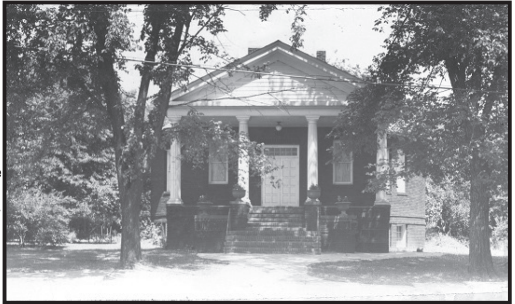
Stow Community Church -located on Elm Road. The church was dedicated in 1920.