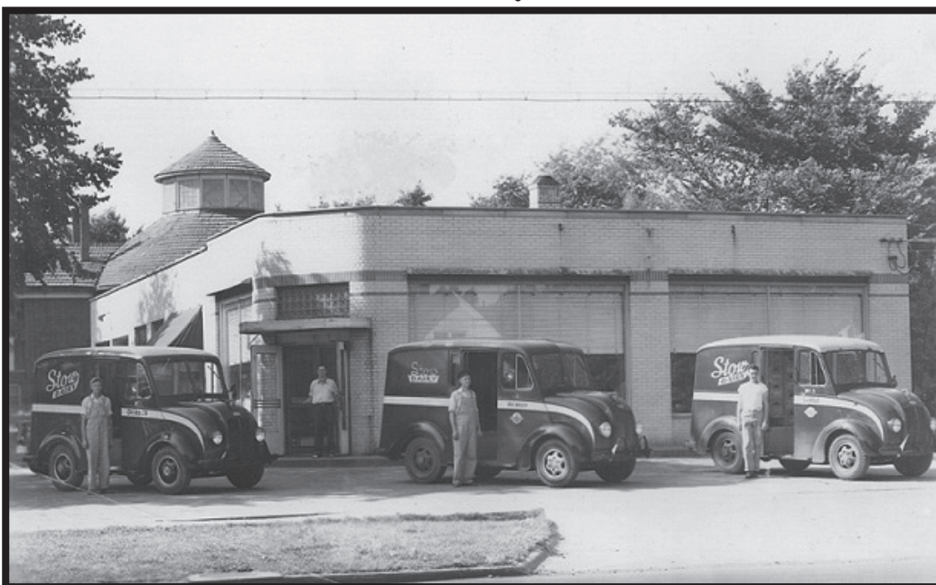
Stow Dairy – located directly south of Stow Community Church – was a prominent advertiser in The Community Church News

The first issue was published Friday, January 26,