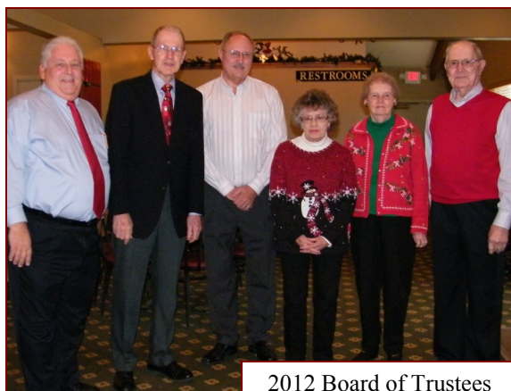
2012 Board of Trustees

All of our Members Meetings will be on the 4 th Monday of the month. All the announcements of the meeting dates, times and programs being presented will be in the Stow Sentry, on the City TV channel 15 and on the City Web site. Please look for them. The main goal for our society this year is the addition of at least 4 active members. Bring your neighbors and friends to our meetings, and tell them that we do indeed have an agenda and a goal.